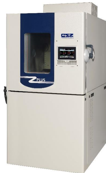
Figure 1 - Reach-In Chamber

Modular walk-ins are constructed from pre-formed panels with urethane foam insulation, similar to walk-in refrigeration units you see at restaurants and supermarkets. The temperature and humidity range must be limited due to this construction. Normally, the maximum high temperature for modular walk-ins is between 100°C and 121°C. The humidity range typically is limited to 70°C and 95% RH. Welded walk-ins are constructed like reach-in chambers. The internal chamber is welded together to withstand more extreme temperature and humidity ranges. This type of walk-in chamber also may withstand altitude conditions. Due to the additional labor to construct this type of chamber, it is much more expensive than a modular walk-in.