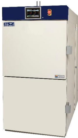
Figure 2 – Thermal Shock Chamber

Thermal shock chambers come in many different sizes and configurations (Figure 2). These chambers can move the product from one temperature condition to another within a matter of seconds. Moving from a high temperature to a low temperature quickly thermally shocks and stresses the product. By performing these tests, the manufacturer can check the reliability of its process.